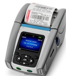
ZQ610-HC ZQ61-HUWA000-00 (WiFi Model)