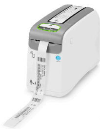
ZD510-HC ZD51013-D01E00FZ (Ethernet Model) ZD51013-D01B01FZ (WiFi Model)

Enable quick identification of special patient conditions with color-coded wristbands from Zebra. Available by cartridge for ZD510-HC, or rolls which are compatible with standard desktop printers.