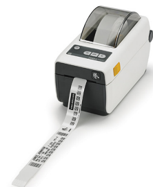
ZD410-HC ZD41H22-D01E00EZ (Ethernet, USB, BTLE) ZD41H22-D01W01EZ (USB, 802.11ac, Bluetooth 4.0)